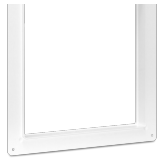
QE-FBA Code 24183