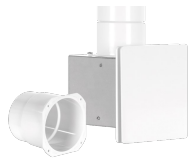
QE-SRK Code 24129