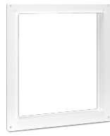
QE-FBA Code 24183